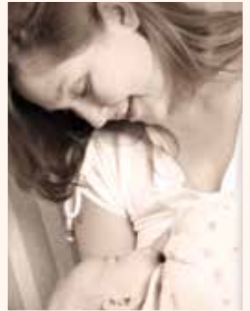
Nurse often when you and your baby are together.